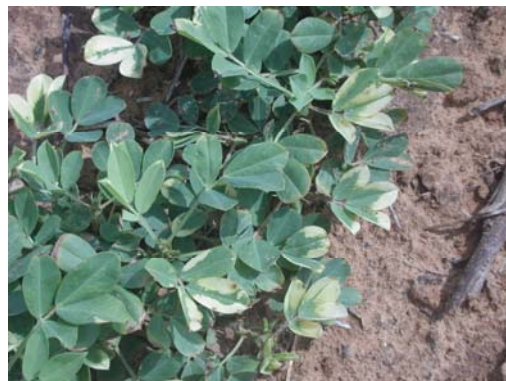
Glyphosate drift on peanut