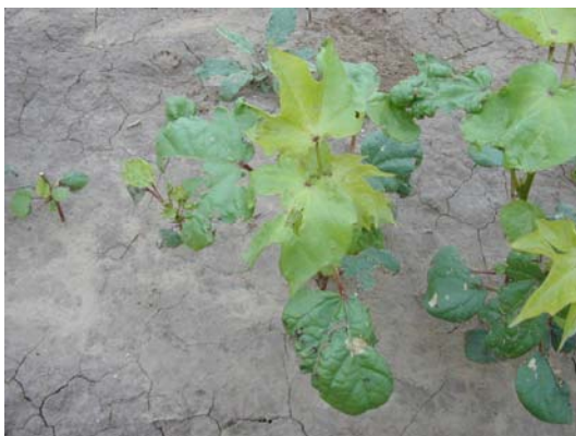
Pursuit drift on cotton plant

Most herbicides will not volatilize (a conversion from the liquid state to a gaseous state), but all herbicides move by means of physical drift (the liquid state moving to non-target plants). We must be aware that over-the-top applications of Roundup in Roundup Ready Flex cotton has the potential to damage adjacent crops including peanut. Conversely, applications of Cadre, Pursuit, Cobra, and 2,4-DB made to peanut can damage adjacent cotton fields. Call Pete @ 806.746.6101 with any of your weed control issues.