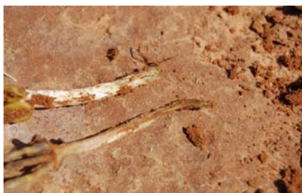
Pythium on peanut hypocotyls (Note water-soaked appearance).

If you have any questions regarding Pythium pod rot, Aspergillus crown rot, or any other peanut diseases please contact me at 806-746-4053 or via e-mail jewoodward@ag.tamu.edu .