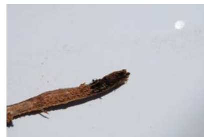
Aspergillus niger spores on the crown of a dead peanut plant.