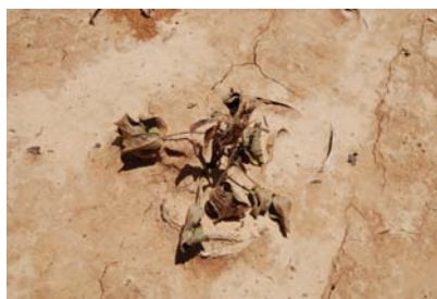
Plant exhibiting symptoms of Aspergillus crown rot.