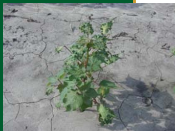
Phenoxy drift on cotton

“Avoid spraying in windy conditions! High wind speed is the number one cause of herbicide drift.”