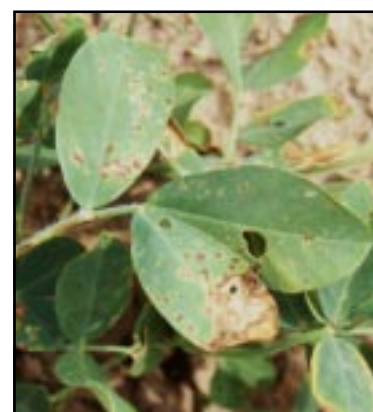
Poast Plus + Crop Oil

Under certain conditions (i.e., hot and humid), the crop oil can cause injury in the form of a leaf burn or spotting. Symptoms of lipid synthesis inhibitor herbicide injury on susceptible grass plants include