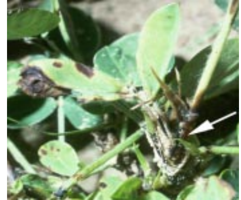
Blackened growth terminal

synthesis inhibitor herbicides are also contained in several premix packages (ex. Canopy, Finesse, Lightning).