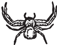
Spider(s) (Size varies with species)